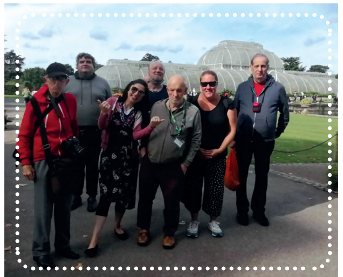
Walking group from Supported Living visiting Kew Gardens

"It's a great way to do some exercise and make friends" "I'm pleased I walked the whole way!"